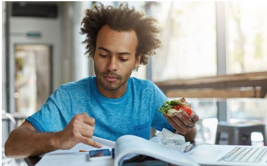
This photo by Unknown Author is licensed under CC BY-NC